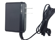
AC-DC power adapter